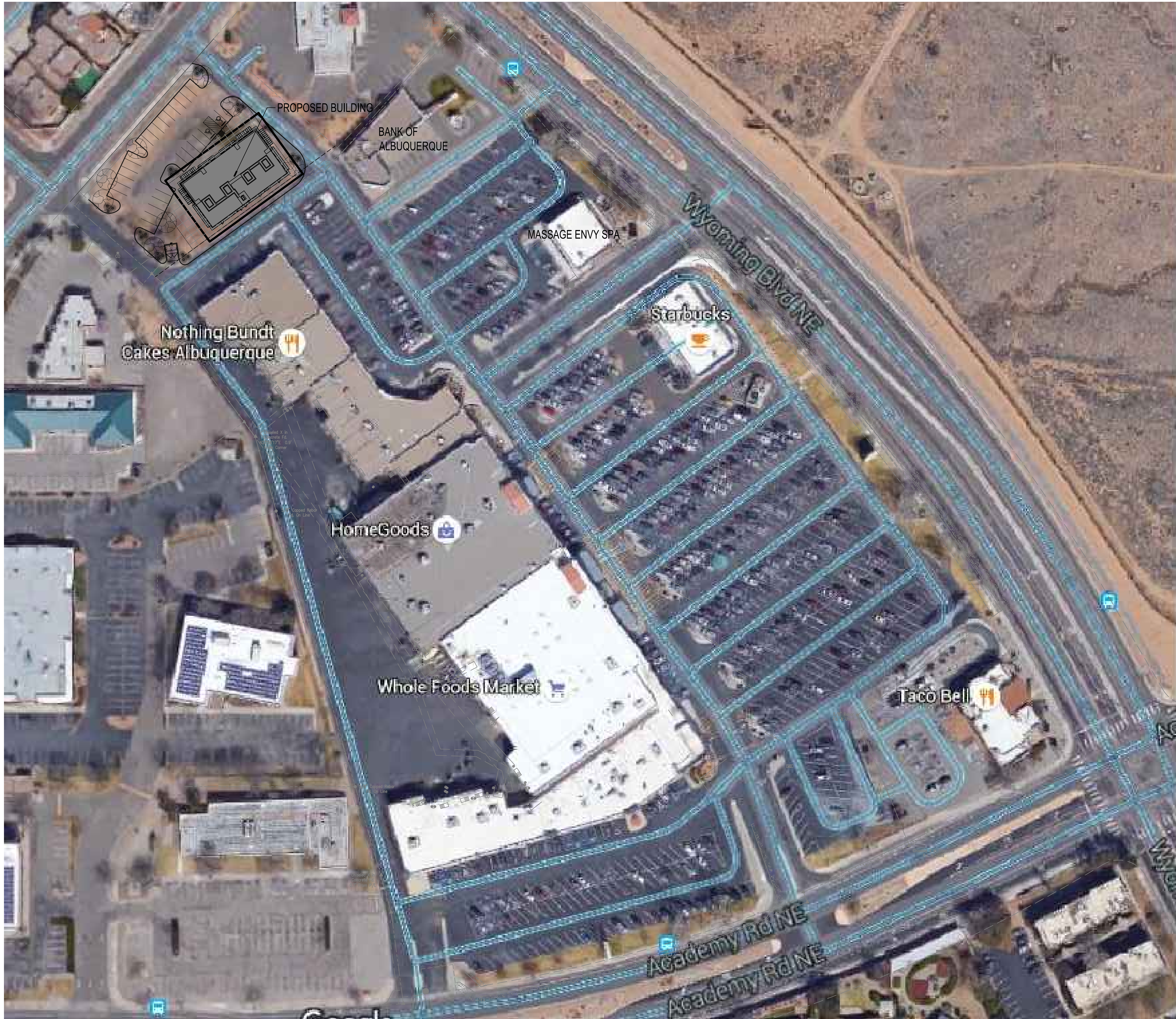
A1 OVERALL SITE MAP SCALE: 1"=500'